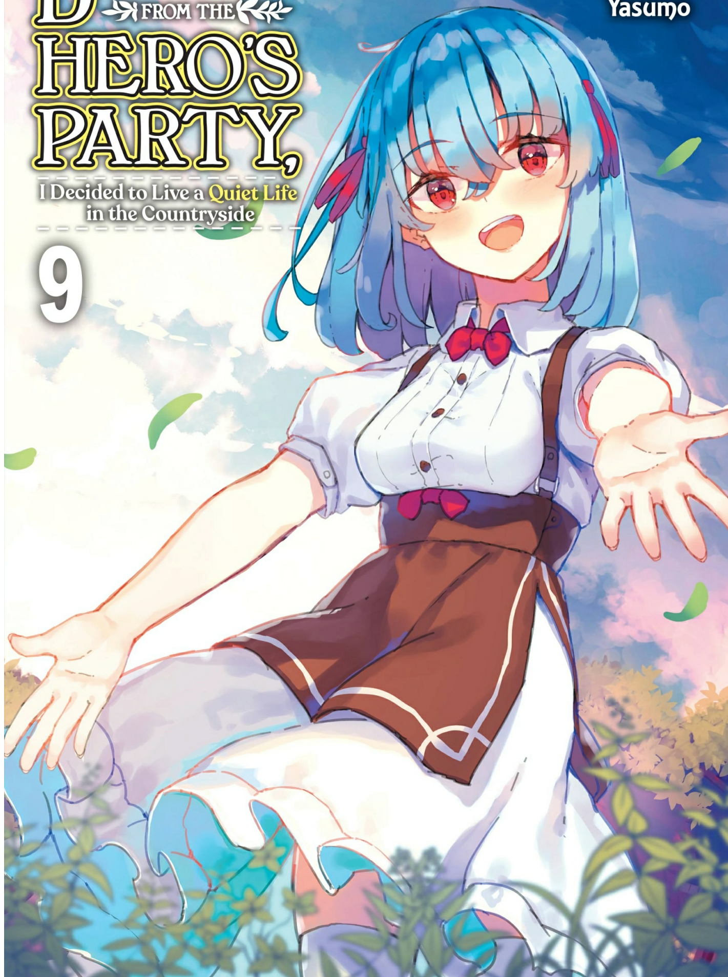
Illustration by Yasumo