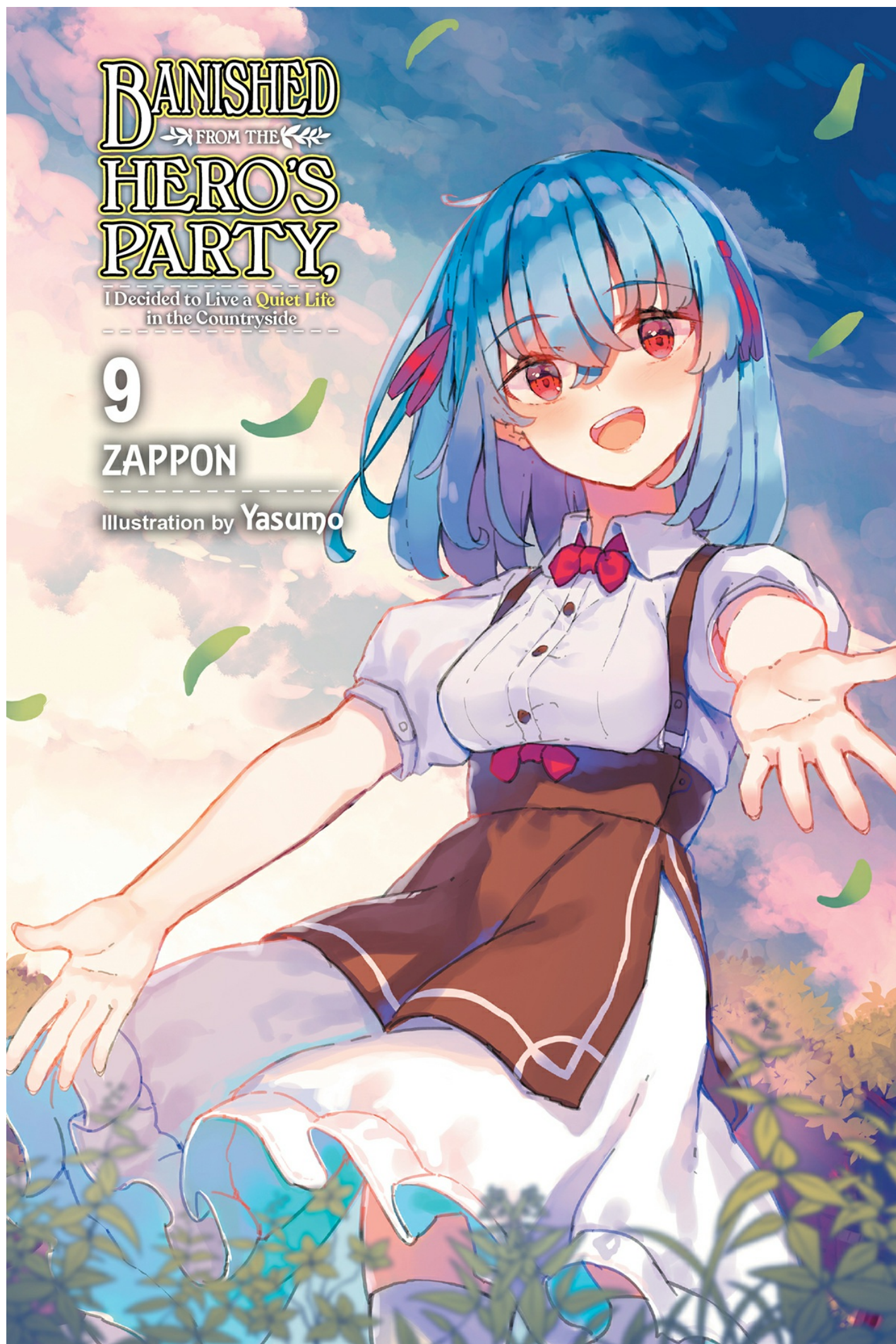
Illustration by Yasumo