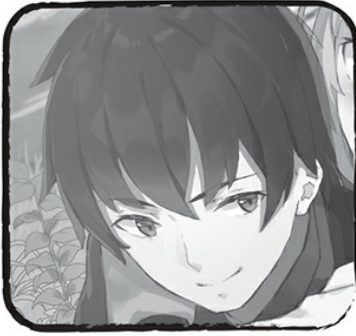
Red (Gideon Ragnason)

Kicked out of the Hero's party, he headed to the frontier to live a slow life. Although not as powerful as Ruti, he's one of humanity's greatest swordsmen, with many feats to his name.