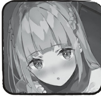
Rit (Rizlet of Loggervia)

Kicked out of the Hero's party, he headed to the frontier to live a slow life. Although not as powerful as Ruti, he's one of humanity's greatest swordsmen, with many feats to his name.